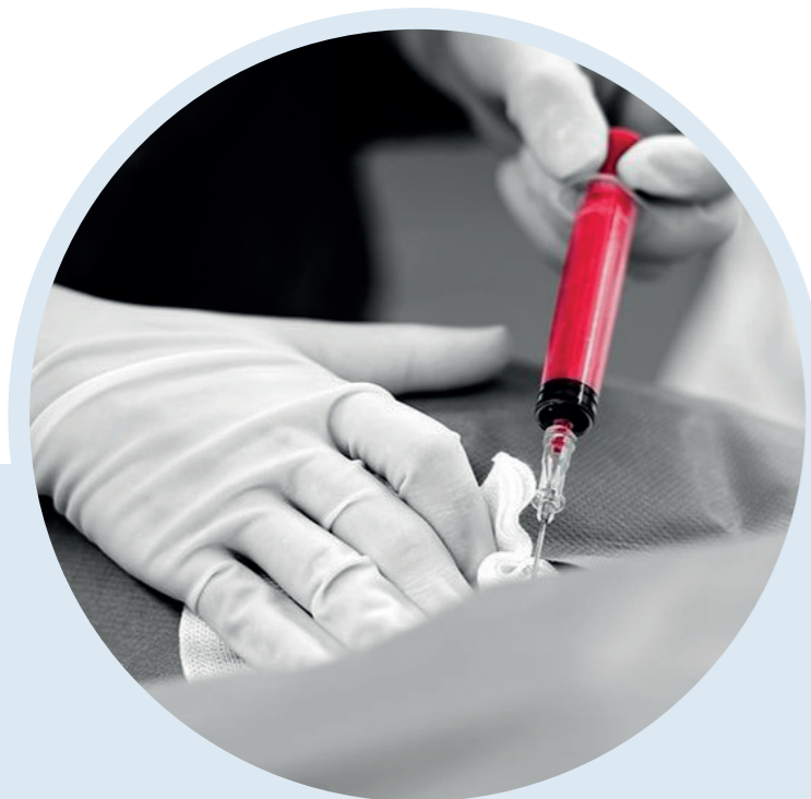
Unique balloon design and controlled deflation enable precise management of distal blood flow, allowing for partial REBOA

The unique design of the COBRA-OS® aortic occlusion device enables precise control over distal blood flow to the lower body, making it suitable for Partial REBOA procedures as well. Partial REBOA is particularly valuable in cases where patients face extended transit times before reaching definitive care.